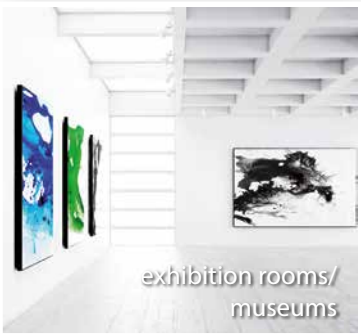
exhibition rooms/ museums